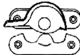
Window lock and Keeper