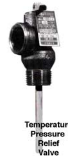
Temperature Pressure Relief Valve

If there is a pressure regulator installed on the water line (usually near the water meter), a thermal expansion tank should be mounted on the cold water pipe above the water heater. This installation is an Ohio Plumbing Code requirement. Water expands as it is heated, raising the pressure in the pipes. That expansion causes faucets to “hammer” and pipes to bang in the walls. Sometimes the expansion will cause the temperature/ pressure relief valve (T-P valve) to leak. The expansion tank eliminates the hammering by giving the water a place to go as it expands.