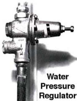
Water Pressure Regulator

When two dissimilar metals such as iron and copper are connected to each other, a weak electrical current is generated. Although you won't feel the current, it will accelerate the corrosion of iron pipe or the steel tank of a water heater. A dielectric union should be used to insulate iron from copper pipes, to minimize the corrosive effect of the electricity.