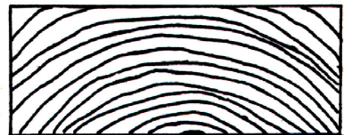
Growth rings pointing down